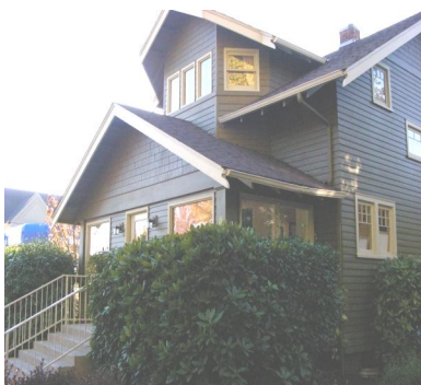
The Arc Administrative Offices and InSight Gallery 414 NW Fourth St., Corvallis